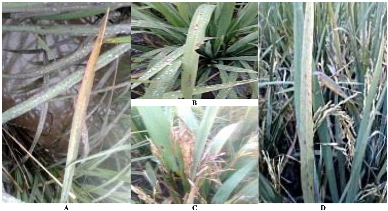
Figure 2. A. The symptom of hawar daun bakteri in generative phase, B. The symptom of blast leaves, C. The symptom of neck blast, D. The symptom of bercak coklat in generative phase.