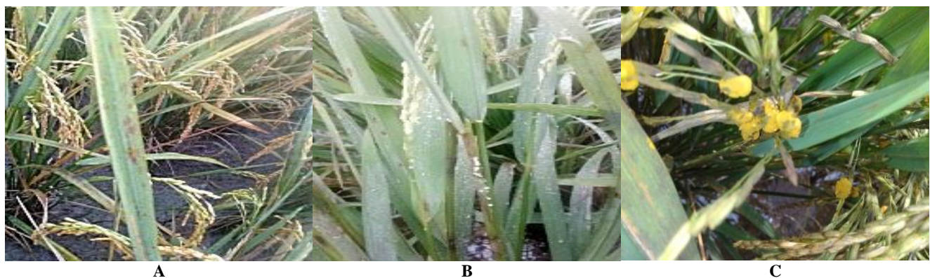
Figure 3. A. The symptom of bercak daun sempit in generative phase. B. The symptom of hawar pelepah/upih in generative phase. C. The symptom of gosong palsu in generative phase.

As seen in Figure 5.A and 5.B, the colony of the fungus C. oryzae appeared to be grayish and was white-colored on the fourth day. By using microscopic observation, the fungus seemed to have cylindrical conidia which consisted of 3-10 septa, brown conidiophore, and growing on individual patches, where the conidium was formed on top of a conidiophore. While Figure 5.C and 5.D implied the colonies of the R. solani fungus. It was likely to be white, and this fungus was capped with hyphens in and many branches. The colony of U. virens appeared to be grayish-brown on the fourth day. Microscopically, this fungus has a spore, spiked, and germinated by forming a smaller