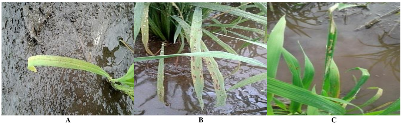
Figure 1. A. The symptom of hawar daun bakteri in vegetative phase. B. The symptom of blast in vegetative phase. C. The symptom of bercak coklat in vegetative phase.

Based on the results of the macroscopical observations, the colony of the bacteria Xanthomonas campestris pv. oryzae Dye was identified by the appearance of rounded convex with a yellow surface area, as presented in Figure 4.A and 4.B. While Figure 4.C presented the isolation of microcystic observation of bacilli colony from fungus Pyricularia grisea (Cke) Sacc. Based on the microscopic observation, the fungus seemed to have a long, sparse, single, and gray-colored conidiophore, which formed a conidium at the end. As shown in Figure 4.D, conidium looked like an oval with a pointed tip and was insulated into three-room with gram-negative color (red). While Figure 4.E indicated the colonies of H. oryzae , which appeared to be white on the fourth day. With microscopic observation, this fungus was seen to have a slightly curved Conidia (curve), enlarged in the center, smeared, brownish, and germinated from both end cells (Figure 4.F).