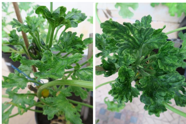
Figure 1. Inoculum source of ZYMV isolates Bali, Indonesia on zucchini plants