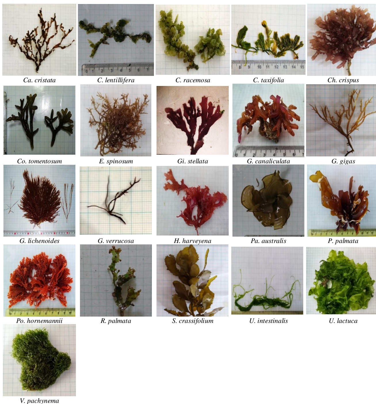
Figure 2. Seaweed has the potential to be bioactive on Menganti Beach, Kebumen District, Indonesia

individuals (Figure 3). The presence of high wave pressure on Menganti Beach causes seaweed with an epilithic type of living trait that can survive, namely seaweed that grows attached to hard substrates such as rocks. According to Aziz and Chasani (2020), many seaweeds' strong current and wave conditions are adapted to the hard substrate so that they are not easily carried away by the current. Umanzor et al. (2019) state substrate is an important factor in determining the presence of seaweed. Each seaweed can grow and develop by attaching to a specific substrate.