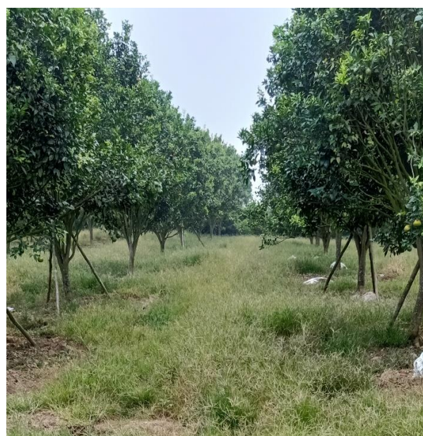
Figure 1. Goosegrass infestation in the citrus field at Rejang Lebong District, Bengkulu Province of Bengkulu, Indonesia

Total density of one species is counted from 18 plots.