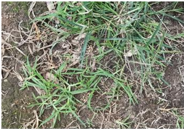
Figure 3. The symptoms of GR goosegrass after 5 weeks treated with glyphosate at 8 L ha -1

In conclusion, glyphosate was used as a main method of weed control in the citrus field in Rejang Lebong District, Bengkulu Province, Indonesia. Weed assessment indicated that a dominant weed in the three areas of the citrus farm was goosegrass, with the dose needed to inhibit 50% of goosegrass between 2.0 and 4.0 L ha -1 . This study provided important information for citrus farmers in Rejang Lebong District on managing weeds with other control strategies, including the early application of glyphosate, herbicide rotation to a different application mode, rotating with other weed control practices such as prevention of weed seed infestation from organic manures, or switching with other weed control practices to be integrated weed management.