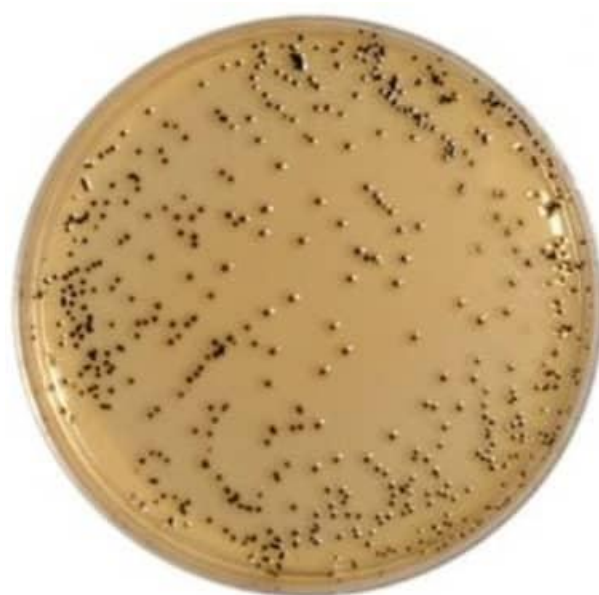
Figure 1. The growth appearance of Salmonella isolates on Salmonella-Shigella agar (SSA) showing black colonies

75% resistant to nitrofurantoin, sulphamethoxazole-trimethoprim, and 100% resistant to ampicillin, tetracycline (Table 3). The resistant patterns of Salmonella isolates obtained in this study include AMP-FT-OFX-SXT-TE; TE-AMP-SXT-FT; AMP-IPM-FT-SXT-TE; AMP-OFX-CTX-FT-SXT-TE; AMP-SXT-CTX-TE; AMP-SXT-TE-CTX-FT; AMP-FT-SXT-TE-C; AMP-CIP-IPM-OFX-TE-CTX; AMP-CTX-OFX-SXT-TE; AMP-FT-OFX-TE-CTX-C. The isolates exhibited multiple antibiotic resistance indexes (MARI) ranging from 0.40 to 0.60 with average MARI of 0.51 (Table 4). The growth appearance of Salmonella isolates on Salmonella-Shigella agar is represented in Figure 1, while the antimicrobial susceptibility appearance of Salmonella species isolated from poultry is presented in Figure 2.