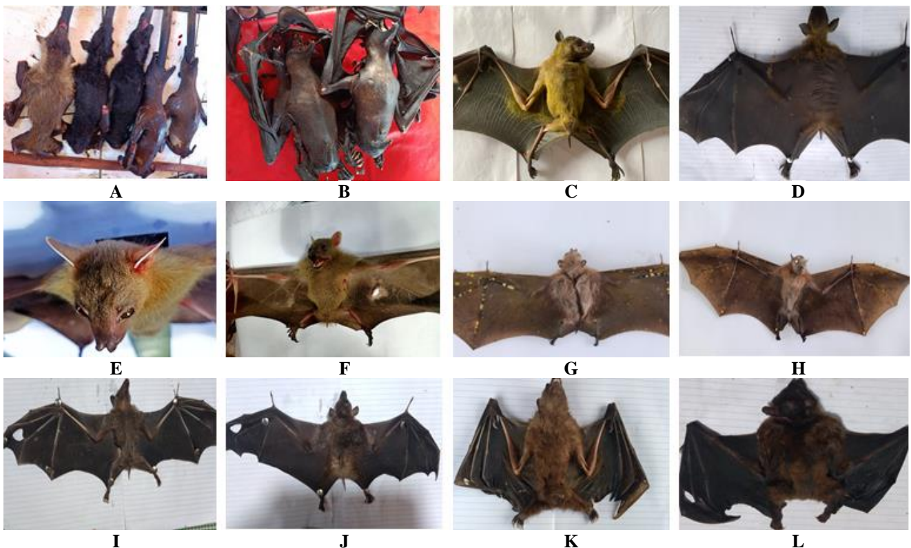
Figure 3. Bat species found in traditional markets of South Minahasa District, North Sulawesi, Indonesia. A. P. Alecto and A. celebensis , B. Grilled flying fox, C. D. exoleta (ventral view), D. D. exoleta (dorsal view), E. C. minutus , F. C. minutus (ventral view), G. N. cephalotes (dorsal view), H. N. cephalotes (ventral view), I. R. amplexicaudatus (ventral view), J. R. amplexicaudatus (dorsal view), K. T. nigrescens (ventral view), L. T. nigrescens (dorsal view)

The body weight of A. celebensis sold in traditional markets of South Minahasa similar with previous studies by Ransaleleh et al. (2013) in Manado City, but higher than body weight of traded A. celebensis in Dumoga market (Ransaleleh et al. 2020). The higher weight range observed in this research is attributed to the unrestricted massive hunting of bats before 2019, as there were no COVID-19 cases, preventing bats from reaching adulthood in their habitat and influencing the lower body weight of the catch. From 2019 to 2022, due to the COVID-19 pandemic, there was strict supervision at border checkpoints between North Sulawesi and Gorontalo Provinces as the trade points for wild animals, including bats.