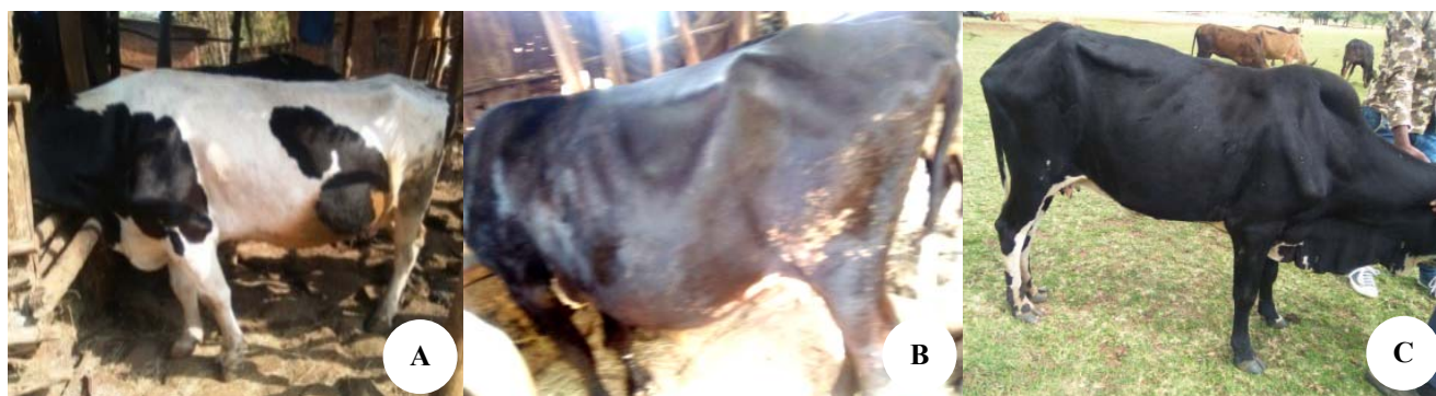
Figure 6. Sickle leg and high pin cross cow (A, B), and normal leg and rump position indigenous cow (C)