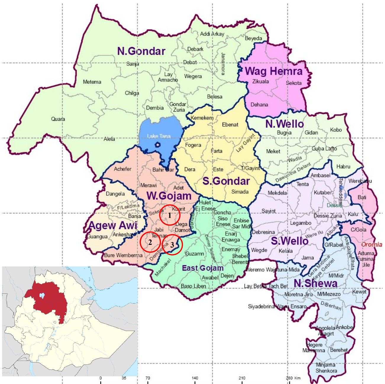
Figure 1. Map of the study areas in three selected districts of West Gojjam, Amhara, Ethiopia. Note: 1. Quarit, 2. Finote Selam, and 3. Debecha

The research was done in three selected districts (Debecha, Quarit and Finote Selam) of West Gojjam administrative zones of western Amhara located at 300 km (Debecha), 427 km (Quarit), and 385 km (Finote Selam) from Addis Ababa (Figure 1, Table 1).