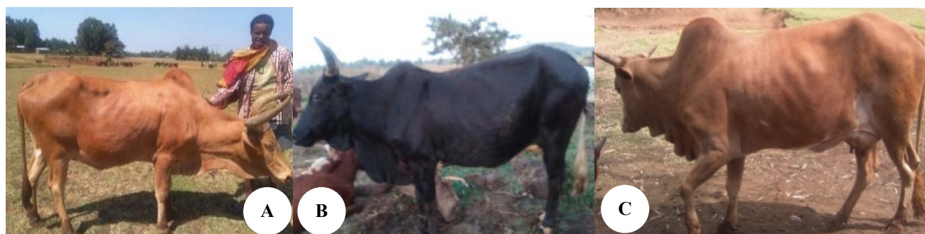
Figure 3. Indigenous dairy type cow at Debecha (A), dual type cow at Finote Selam (B) and meat type cow at Debecha (C)

There was higher significant variation ( P < 0.0001 ) of wider at the point of shoulder (WAS) in meat type than the rest of cattle types (Figure 4). But there was no significant variation of WAS between dairy type and crossbred cattle. Narrowness WAS (excellent sharpness over the withers) is a common conformation of ideal dairy cattle. Wideness (thick over the withers) of WAS is a common conformation of ideal meat/ beef cattle. As indicated by ICAR (2015), sharpness over the withers leads more (dairyness,