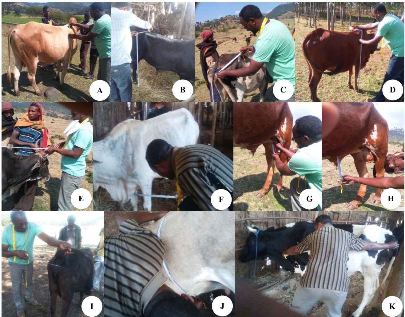
Figure 2. Morphological body measurements in the field. Note: A=HG, B=RH, C=RL, D=WH, E= NL, F=CW, G= SL, H= PSL, I= RW, J= BD, K= BL