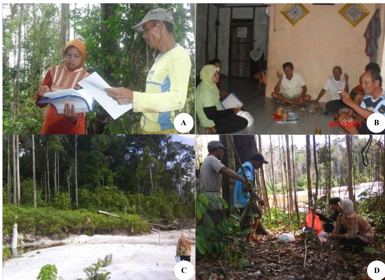
Figure 2. A. Interview with the key informant. B. Focus Group Discussion with miners. C. Floristic survey at the gold mining in Central Kapuas, Central Kalimantan, Indonesia

Data from ethnobotanical surveys were collected using the observation and in-depth interviews with 40 local gold miners in Central Kapuas District. This study used purposive sampling technique (Tongco 2007) to obtain information about the object of the study, then analyzed descriptively. The recorded data informant include: name of informant, age, long worked as a miner, the last education, and knowledge about plants indicator of gold. To find out the utilization of each species of plants and calculate an index of interest types of plants (Fidelity level) and comparing the relative knowledge of the informant used the formula as follows: