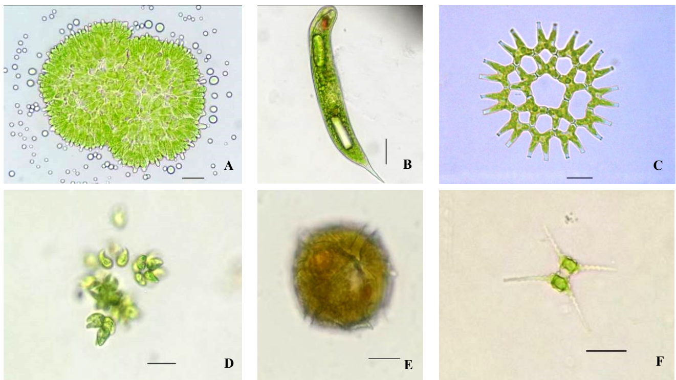
Figure 3. A-C. Dominant species of microalgae in Nong Bua Reservoir, northern Thailand: A. Botryococcus braunii Kützinger, B. Lepocinclis oxyuris (Schmarda) Marin & Melkonian and C. Pediastrum duplex var. duplex Meyen. D-F. Dominant species of microalgae in Chiang Saen Lake, northern Thailand: D. Kirchneriella lunaris (Kirchner) Möbius, E. Peridinium sp. and F. Staurastrum sp.1 (scale bar = 10 μm)

Ninety species and 55 species of microalgae were isolated from Nong Bua Reservoir and Chiang Saen Lake, respectively. However, only 25 isolates of microalgae were isolated from Nong Bua Reservoir, and 6 isolates were isolated from Chiang Saen Lake. Most of the isolates (26 isolation) were green microalgae followed by blue-green algae (5 isolation), but the microalgae in another group were not able to grow in JM medium. The lipid content was highest in Botryococcus braunii ( 39.25 \pm 0.32\% dry weight) followed by Ankistrodesmus (NB) ( 26.80 \pm 0.44\% dry weight) and Coelastrum microsporum ( 24.95 \pm 0.55\% dry weight), and the lowest lipid content was found in Planktolyngbya sp. ( 7.25 \pm 0.43\% dry weight). Isolates collected from the two reservoirs revealed differing lipid contents (Table 3).