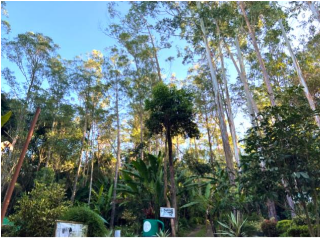
Figure 2. Multi-layered vegetation structure at the Binahon Agroforestry Farm (BAFF), Lantapan, Bukidnon, illustrating canopy and understory composition within managed agroforestry system

At present, the farm serves as a model for sustainable multi-storey farming (Espaldon 2008). The farm operates several integrated components including seedling production, farm tourism, food processing, organic agriculture, high-value vegetable crop production, herbs and spices, orchard gardens, industrial and ornamental crops, poultry and livestock, and transportation services. It also serves as an accredited learning site of the Agricultural Training Institute for training activities related to sustainable agriculture and agroforestry practices. Unlike many agroforestry systems in the region that are primarily practiced for subsistence or smallholder production, BAFF was intentionally developed to demonstrate ecologically sustainable upland farming and diversified agroforestry practices.