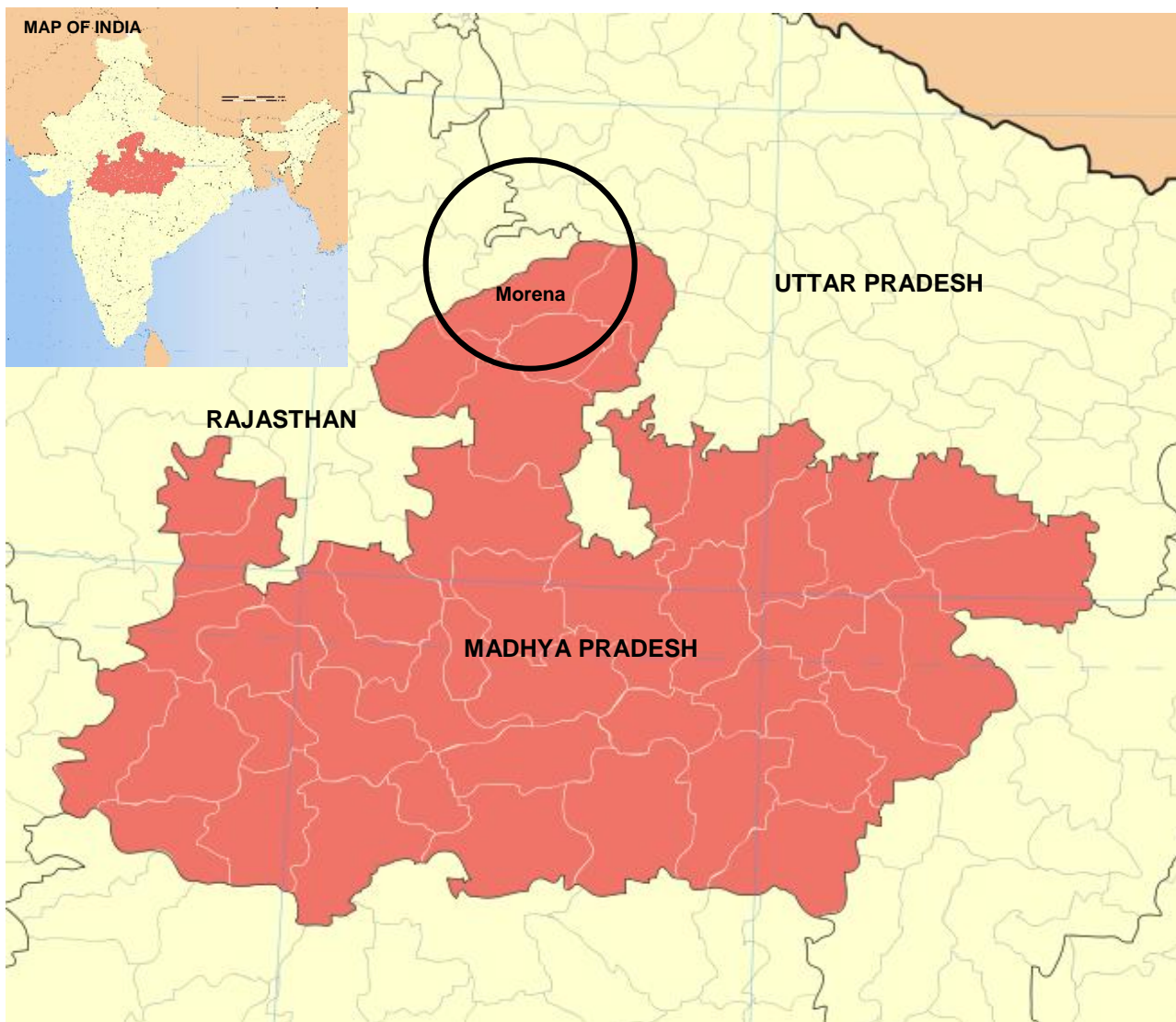
Figure 1. National Chambal Sanctuary in three states of Madhya Pradesh, Uttar Pradesh and Rajasthan, India (circle).

p_i = is the proportional abundance of the i th species s = total number of species \ln = is the log with base 'e' (Natural log)