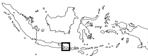
Figure 1. Study location and water sampling points at the Lake Batur, Bali, Indonesia. Point: 1 (08°16'38.5"S-115°23'30.9"E), 2 (08°15'43.9"S-115°24'17.2"E), and 3 (08°14'16.2"S-115°24'55.1"E)

Water quality can be assessed by various parameters such as BOD, temperature, electrical conductivity, nitrate, phosphorus, potassium, dissolved oxygen, etc (Bhateria and Jain 2016). To analyze the Lake Batur water quality, six water samples were taken at two water depths, 0.5 m and 50 m from the water surface at three sampling sites, i.e., WSP1 (08°16'38.5"S-115°23'30.9"E), WSP2 (08°15'43.9"S-115°24'17.2"E) and WSP3 (08°15'43.9"S-115°24'17.2"E). The water samples were taken on September 24 th , 2017 using deep water sampler and brought to the laboratory on the following day. Selected physical, organic and inorganic chemical, and microbiological parameters were analysed and compared to national water quality standard class II based on Government Regulation No. 82, 2001 and regional water quality standard based on Governor Regulation of Bali Province number 16, 2016.