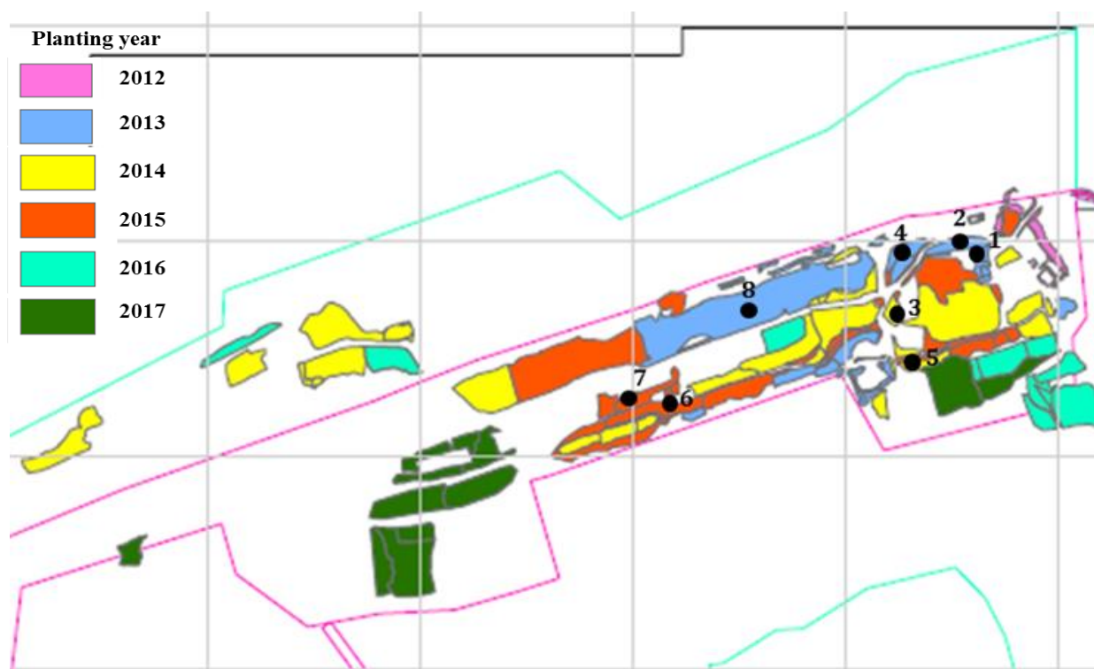
Figure 2. Observation plots in reclamation site of the study area: 1. Enterolobium cyclocarpum as shade trees, 2. Anthocephalus chinensis as shade trees, 3. Anthocephalus chinensis as shade trees, 4. Enterolobium cyclocarpum , Anthocephalus chinensis and Albizia saman as shade trees, 5. without shade trees and on 60° sloping terrain, 6. without shade species and on 30° sloping terrain, 7. without shade trees and on flat terrain, and 8. without shade trees and flat terrain