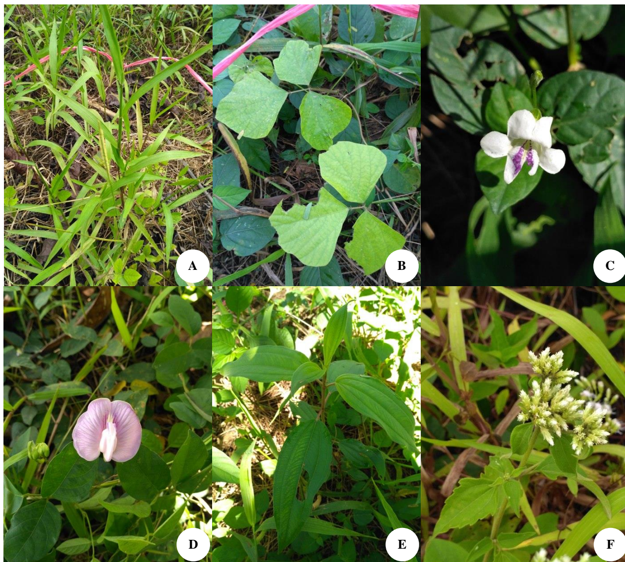
Figure 5. Most commonly found species of understorey plants in observation plots of reclamation area: A. Paspalum conjugatum , B. Calopogonium mucunoides , C. Asystasia gangetica , D. Centrosema pubescens , E. Melastoma malabathricum , and F. Chromolaena odorata

S. lamellata (white meranti) shows same growth performance in both flat or sloping terrain. This is a native plant species distributed in Sumatra, adapted to an altitude ranging from 0 to 700 m above sea level and capable of growing in dry land, sometimes inundated, rocky soil and sandy soil with flat to undulated topography. In areas with 25% slope, S. lamellata is found in groups (Ashton 1998a; Istomo and Afnani 2014). This species was able to grow and adapt well in the reclamation area, even though its growth is slow.