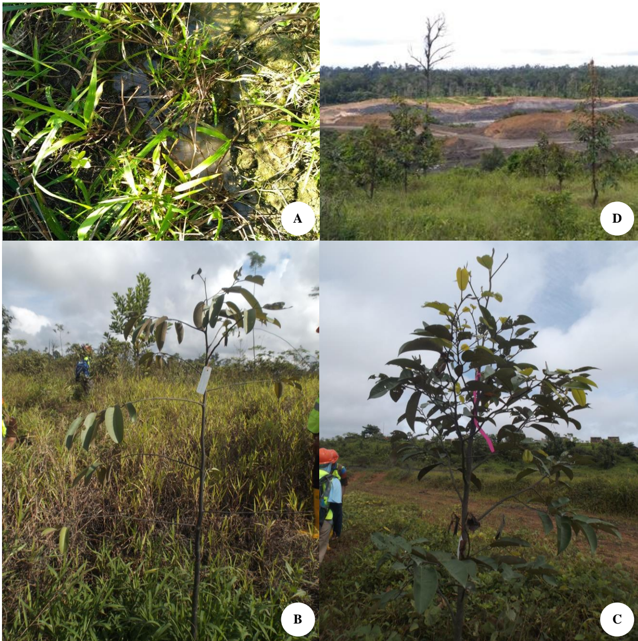
Figure 3. Comparison of growth of Shorea balangeran in different conditions of post-coal mining reclamation area; A. Flat area with inundating water, Plot 8, B. Growth condition of S. balangeran in flat area with inundating water, Plot 8, C. Growth condition of S. balangeran in sloping terrain (60°), Plot 5, D. Sloping terrain (60°) of plot 5

Plants species known for their survival and adaptation to different habitat conditions on the reclamation area of former coal mines are S. lamellata , S. balangeran , D. moluccana , P. gutta , D. oblongifolia and N. macrophylla . The growth performance of plants in the reclamation area of ex-mined land can be known by their increasing height and diameter as age increasing after planting (Budiana et al. 2017).