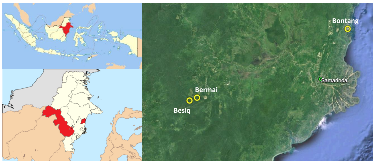
Figure 1. Location of Besiq-Bermai (West Kutai District) and Bontang forests in East Kalimantan, Indonesia. Besiq-Bermai in N 9905934.554001633, E 326615.6294839026, and Bontang forest in N 0009.52.4, E 117.21.55

recorded with purposive random sampling, in which the data recorded is determined based on the presence of Smilax species. Field research was conducted on February and August 2012, and July-August 2015 in Besiq-Bermai and Bontang forest area, East Kalimantan. Identification of Smilax is done in Purwodadi Botanic Garden, Pasuruan, Indonesia and Herbarium Bogoriense (BO), Research Center for Biology, Indonesian Institute of Sciences (LIPI), Bogor, Indonesia.