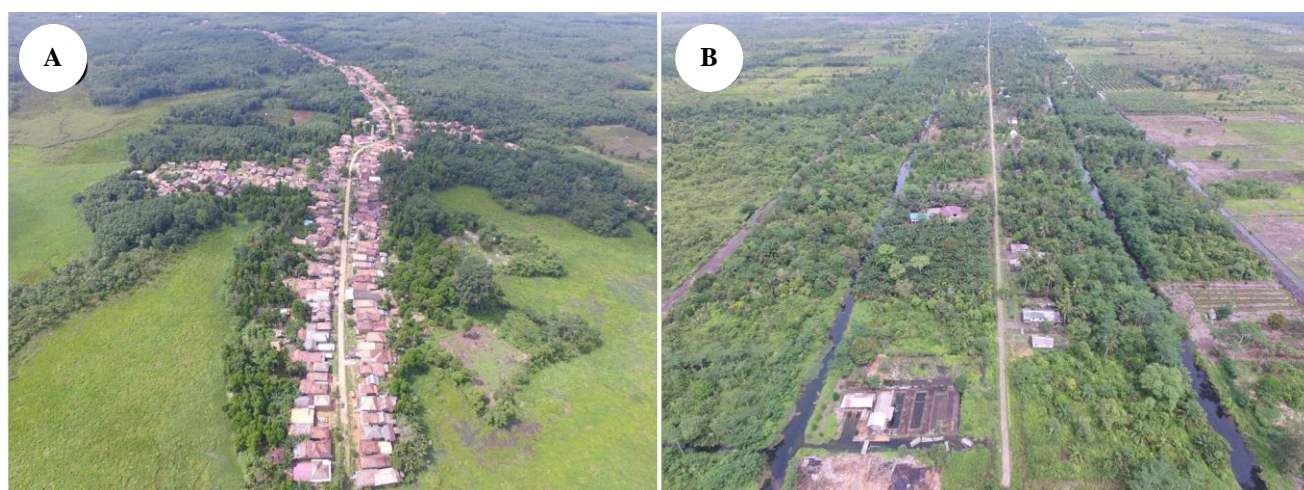
Figure 2. Landscape of (A) Sedang Village, and (B) Muara Sugih Village, Banyuasin District, South Sumatra, Indonesia