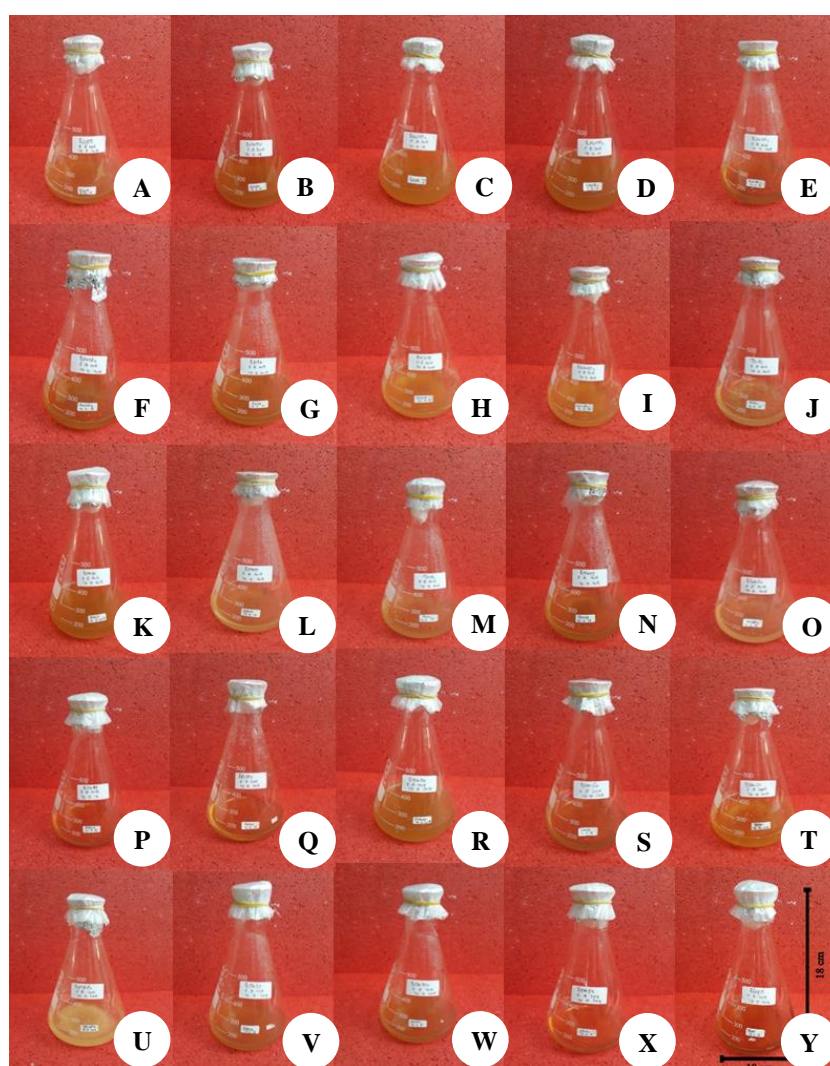
Figure 4. Beauveria bassiana culture filtrate: BJgTs (A), BSmMs (B), BSwTd1 (C), BSwTd2 (D), BSwTd3 (E), BSwTd4 (F), BPdR (G), BKbTp (H), BKKPp2 (I), Ts1d3 (J), BTmPc (K), BTmTr (L), (M) Ts1d2 (M), BTmTs (N), BlePd2 (O), BTmKt (P), BPCmS (Q), BMkMs (R), BtmGa (S), BTmSr (T), BPcPd2 (U), BtmSo (V), BtmMa (W), BtmPe (X), Blepd (Y)

After the host insect died, it entered into the saprophytic phase which was influenced by favorable environmental conditions (Peña-Peña et al. 2015). In the body of the dead insect, the fungus formed mycelia and hyphae which continued to grow covering the body of the host insect, and then the hyphae formed conidiogenous cells and the conidia were produced by utilizing the nutrients/fluids of the host insect and finally, the infection process was complete (El-Ghany 2015).