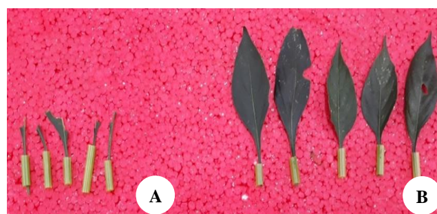
Figure 8. The leaf damage: control (A) and larval Spodoptera litura applied with Metarhizium anisopliae culture filtrate (B)