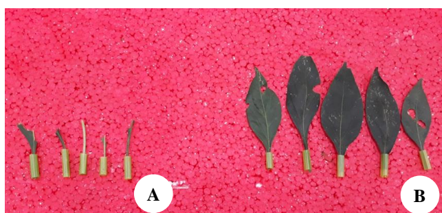
Figure 7. The leaf damage: control (A) and larval Spodoptera litura applied with Beauveria bassiana culture filtrate (B)