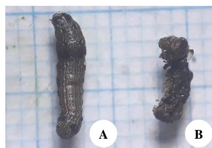
Figure 10. The healthy (A) and dead larvae (B) of Spodoptera litura caused by Metarhizium anisopliae culture filtrate