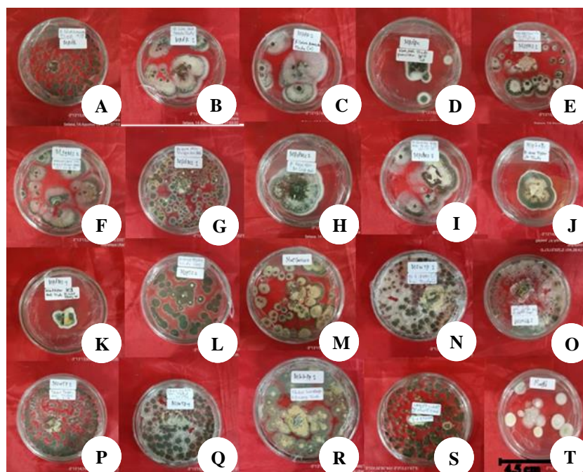
Figure 2. Metarhizium isolates cultured in SDA media: MPdB (A), MPdR1 (B), MPdR2 (C), MpdPe (D), MJgMs1 (E), MJgMs2 (F), MPdMs1 (G), MPdMs2 (H), MPdMs3 (I), MjgKeTs (J), MPdMs4 (K), MJgTs2 (L), MKbTp1 (M), MSwTp1 (N), MSwTp2 (O), MSwTp3 (P), MSwTp4 (Q), MKKp1 (R), MKbTp2 (S), MagPd (T)