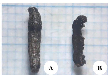
Figure 9. The healthy (A) and dead larvae (B) of Spodoptera litura caused by Beauveria bassiana culture filtrate