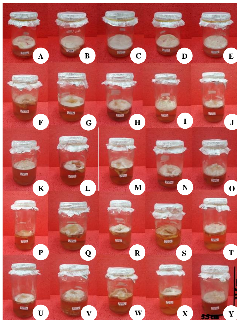
Figure 3. Beauveria bassiana isolates cultured in PDB: BJgTs (A), BSmMs (B), BSwTd1 (C), BSwTd2 (D), BSwTd3 (E), BSwTd4 (F), BPdR (G), BKbTp (H), BKKPp2 (I), Ts1d3 (J), BTmPc (K), BTmTr (L), (M) Ts1d2 (M), BTmTs (N), BlePd2 (O), BTmKt (P), BPCmS (Q), BMkMs (R), BtmGa (S), BTmSr (T), BPcPd2 (U), BtmSo (V), BtmMa (W), BtmPe (X), Blepd (Y)