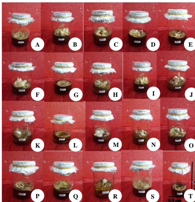
Figure 5. Metarhizium anisopliae isolates cultured in PDB: MPdB (A), MPdR1 (B), MPdR2 (C), MpdPe (D), MJgMs1 (E), MJgMs2 (F), MPdMs1 (G), MPdMs2 (H), MPdMs3 (I), MjgKeTs (J), MPdMs4 (K), MJgTs2 (L), MKbTp1 (M), MSwTp1 (N), MSwTp2 (O), MSwTp3 (P), MSwTp4 (Q), MKKp1 (R), MKbTp2 (S), MagPd (T)

The color of fungal broth and culture of B. bassiana and M. anisopliae varied between isolates. The darker color of fungal broths and culture filtrates tend to cause higher mortality. In line with the results obtained by Ayudya et al. (2019), the darker culture filtrates tended to be more toxic than the light-colored ones. The darker culture filtrates show higher production of secondary metabolites (Luo et al. 2017) and the activity of extracellular enzymes (Khachatourians et al. 2007) and the enzymes produced such as proteases are able to dissolve integument insects that result in death (Mancillas-Paredes et al. 2019).