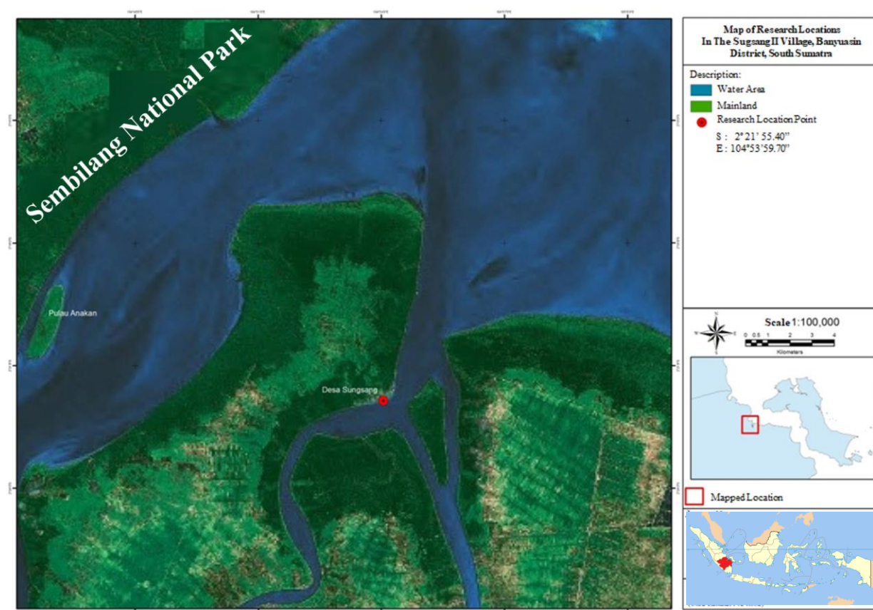
Figure 1. Mudskipper sampling site in Sungsang II Village, Banyuasin District, South Sumatra, Indonesia