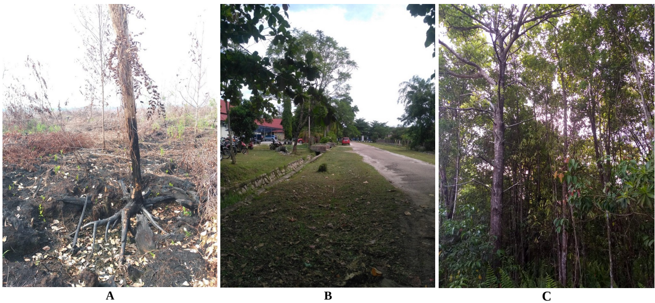
Figure 2. Habitat type at three observation sites, University of Palangka Raya, Central Kalimantan, Indonesia: A. Burned area, B. Around building, C. Unburned area