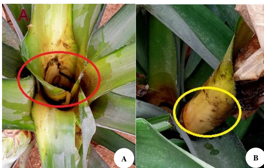
Figure 2. The symptoms of bacteria heart rot disease in the pineapple plant. In both parts of the photo, a water-soaked lesion is exhibited on the leaves' white basal portion, located in the central whorl. The green mid-portion of the leaves shows the olive-green color and dark border formed. A. Aerial view of the plant peduncle (red circle). B. Internal view after removing the peduncle (yellow circle)