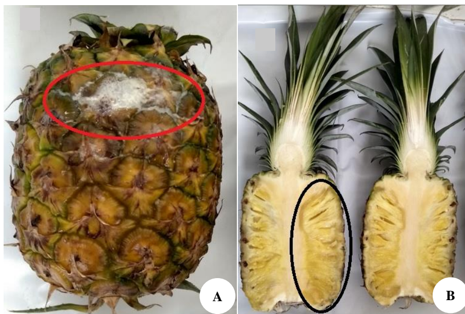
Figure 1. The symptoms of fruit collapse disease in pineapple after harvest. A. Release of gas by bubbles together with olive-green color in the shell (red circle). B. Cavities within the skeletal collapsed fibres in the flesh (black circle).