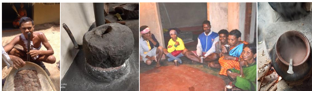
Figure 2. A. Germinated finger millet, B. Traditional tool ( Jata ), C. Women and children enjoying Landa during evening hour, D. Pej at its final form

The nutritional parameters concerning collected samples included pH, fat, protein, carbohydrate, energy, forms of amino acid and the functional bacterium (Table 1). The pH of collected samples varied from 3.62 in Landa to 4 in Pej . The protein content of Landa was found to be 1.026 mg/mL and it was found to be 0.228 mg/mL in Pej . Carbohydrate content of samples ranged from 3.6 mg/mL in Landa to 3.424 mg/mL in Pej while the form of carbohydrate in both the beverages is reducing sugar (Hexose). Both the beverages represented the absence of fat. The energy value of Landa and Pej stood at 1.8504 Cal/100 mL and 1.4608 Cal/100 mL respectively. Yeast was present in both the beverages and Coccus sp. was the functional bacterium responsible for fermentation process in Landa and Pej (Figure 3). The form of amino acids was similar in both the beverage and includes tyrosine (Y), phenylalanine (F), tryptophan (W), arginine (R) and cysteine (C).