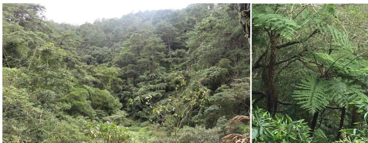
Figure 7. Giant tree fern ( Cyathea spinulosa )