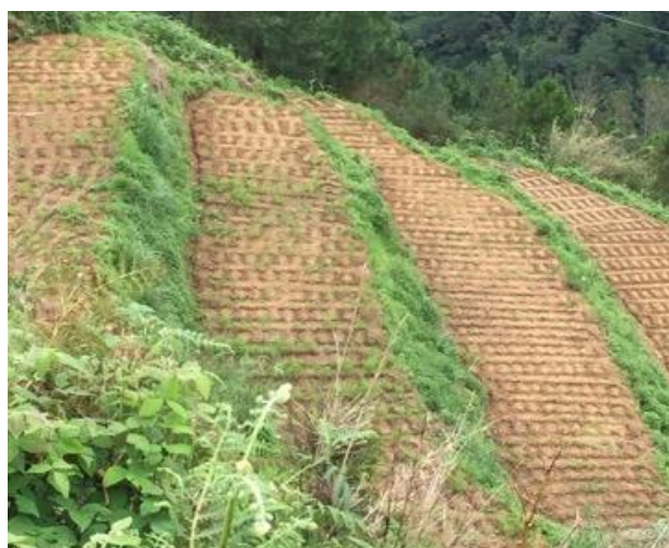
Figure 3. Establishment of terraces along the steep slopes to prevent soil erosion