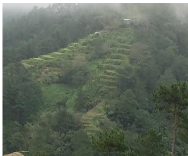
Figure 4. One of the soil and water conservation measures is the establishment of bench terraces to arrest soil erosion