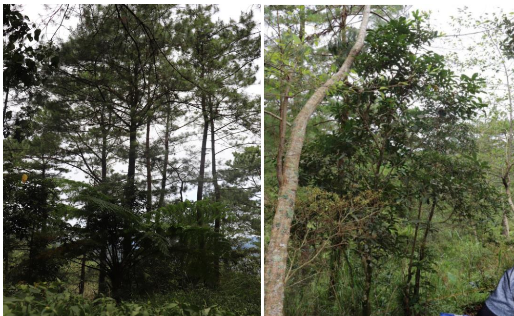
Figure 6. Communal forest being managed by the village government in Topdac, Atok, Benguet, Philippines