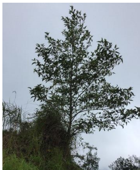
Figure 2. Alnus japonica enhances soil fertility as observed by the farmers

The elders believed that the younger generation should be educated about the need for ecological restoration and the local practices that contribute to ecological restoration. The village leaders conduct regular awareness seminars for the elementary students to provide them an overview of sustainable natural resources management using their local practices. The farmer-respondents also encouraged their children to participate in farm development activities not only to develop their appreciation in farming but also to inculcate unto them that upland farming coupled with proper conservation of the natural resources could be a sustainable livelihood.