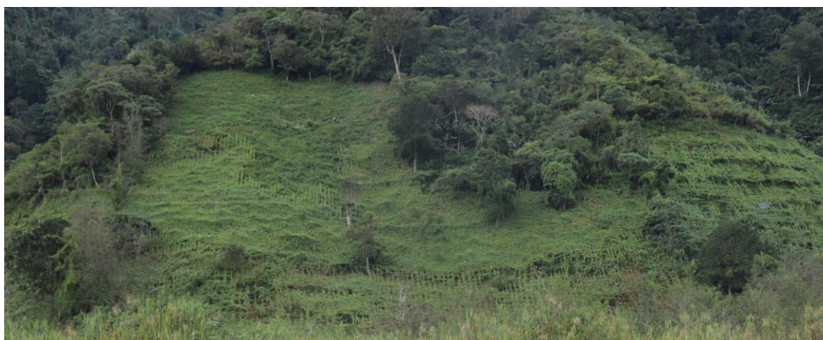
Figure 5. Woody perennials are found along the farm boundaries to prevent soil erosion and to serve as windbreaks