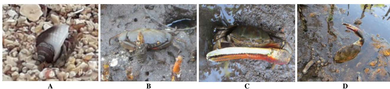
Figure 4. Crabs activity in Pejarakan coastal mangrove (A. hermit crabs are walking on gravel; B. crabs are eating around mangrove roots; C. crab walks in the mud; D. crab in the mud)

Observation of crustaceans begins with field activities, namely by directly observing the fauna in the mangrove area. Ecotourism guides for observing mangrove fauna should have excellent competence (knowledge, expertise, and behavior) to interpret and explain the overall fauna of the mangrove forest habitat well. To assist ecotourism guides in observing fauna to interpret them well, it is necessary to prepare a handbook for crabs identification.