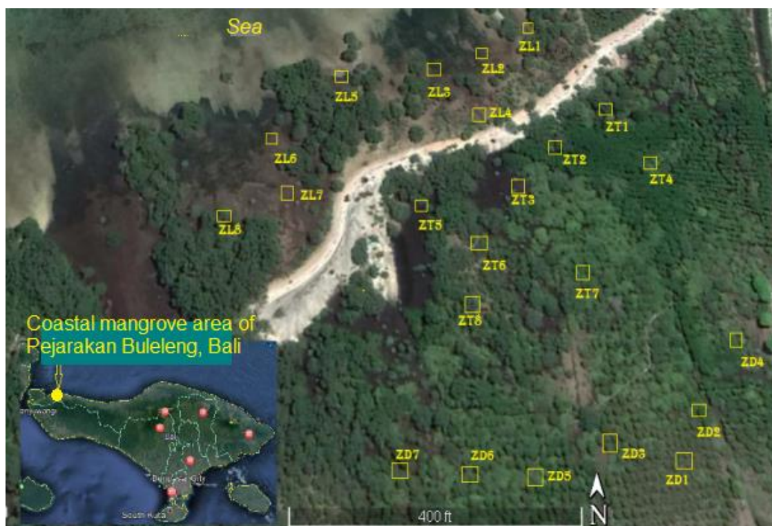
Figure 1. Research location map mangrove ecosystem area in the Putri Menjangan Conservation Forum, Peisisir, Pejarakan Village, Buleleng District, Bali, Indonesia

Habitat of crustaceans is presented descriptively in the form of tables. Analysis of the existence of crustaceans as an attraction for ecotourism refers to the results of the feasibility analysis of mangrove ecosystems as ecotourism objects according to Sari (2015) and Rahmila and Halim (2018).