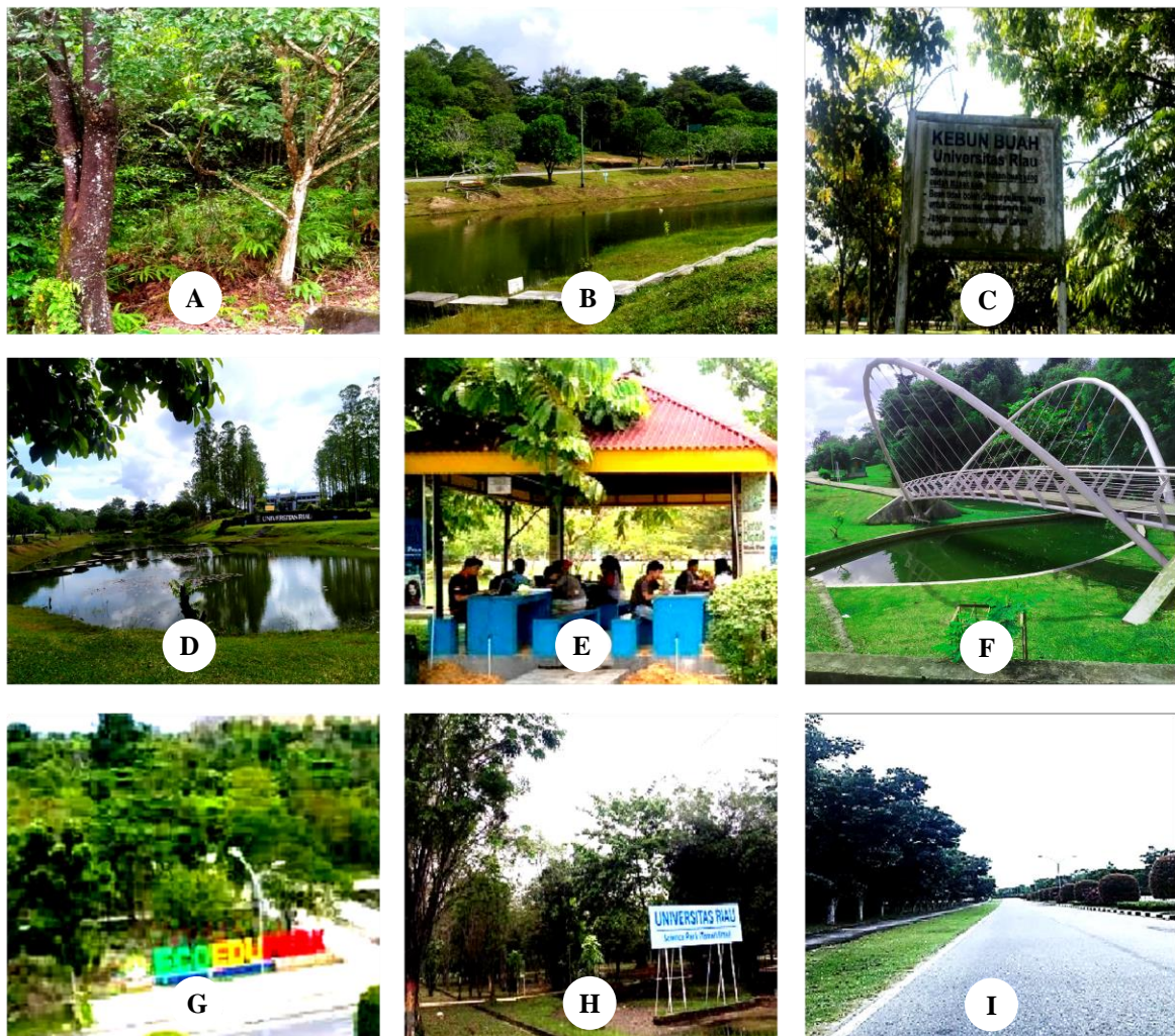
Figure 4. Some areas of vegetation: A. Urban forest /Arboretum; B. Tree vegetation; C. Fruit garden; D. Rectorate park; E. Educational garden; F. Butterfly park; G. Ecoedupark; H. Science park; I. Greenline

Location X is an urban forest where the vegetation is more natural than others so that the vegetation species are more diverse. The Bina Widya Campus is also part of the GOS of the City of Pekanbaru. Riau University was appointed as an urban forest based on the collaboration between the university and the Municipality Government