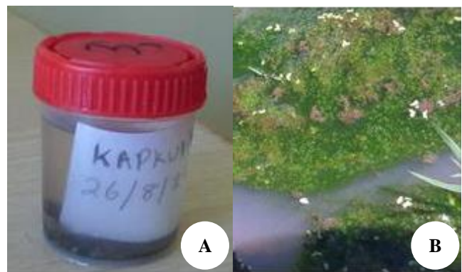
Figure 4. The collection cup contained immature mosquitoes (A), Algae in a habitat (B)

After collection, the immature mosquitoes were transferred into a sealable collection cup using a plastic pipette, directly from the habitat onto a pipette, and finally into the sealable container. The collection cups were filled with water sourced from respective sampled habitats to avoid desiccation of the specimen. A pencil written label