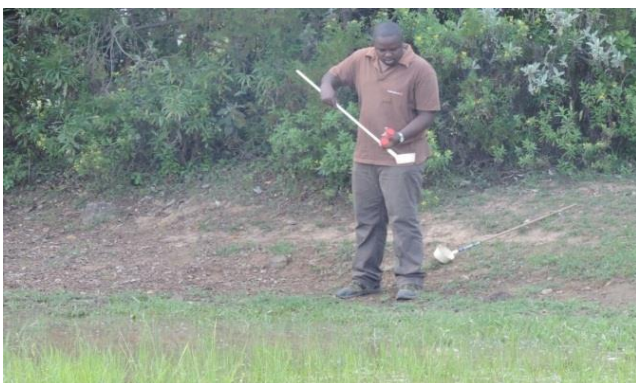
Figure 3. The researcher was inspecting the dipper for immature mosquitoes