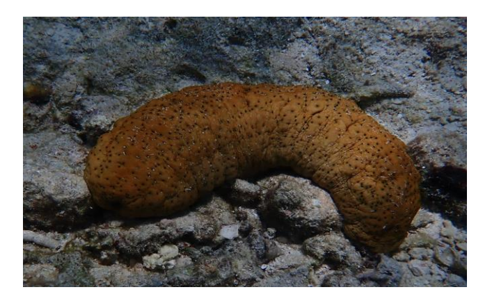
Figure 1. Stichopus hermanii

The distribution of S. hermanii , marked with yelloworange dots on a world map, showed a predominant presence in Southeast Asia and Northern Australia, indicating a preference for warm tropical waters (Figure 2). Their presence in East Africa confirms the global range of this species, which may be influenced by international trade. This information is crucial for ecological studies, conservation efforts, and the development of sustainable aquaculture, providing insights into marine ecosystem health and the role of sea cucumbers in bioturbation. Therefore, understanding this distribution can aid in conservation efforts and in selecting suitable aquaculture locations that match the natural conditions of the golden sea cucumber.