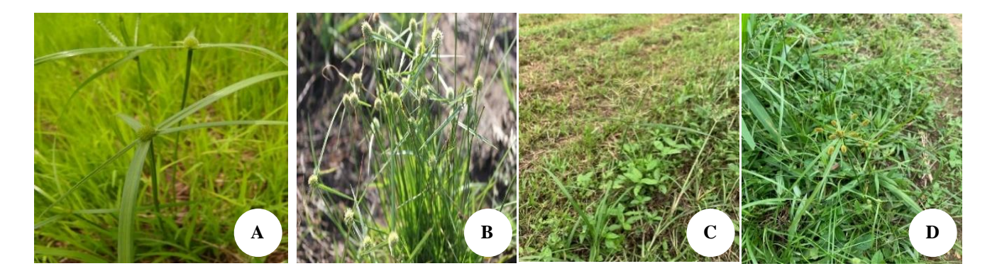
Figure 2. Morphological characters of the four species of Cyperaceae in the field: A. Kyllinga erecta ; B. Kyllinga bulbosa ; C. Pycreus lanceolatus ; D. Mariscus alternifolius