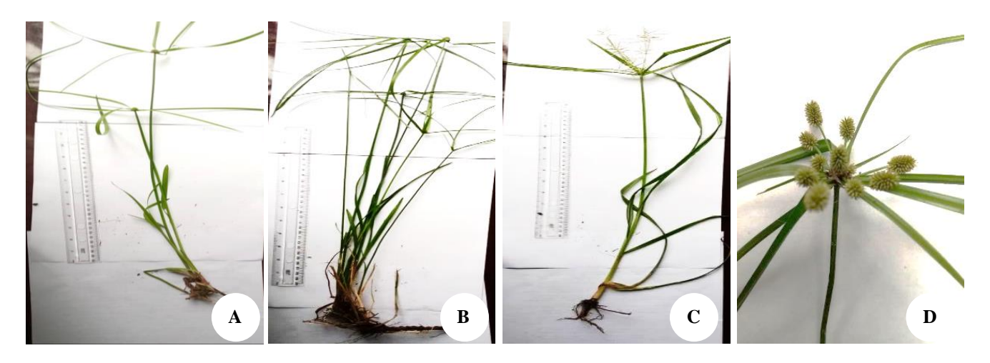
Figure 1. Morphological characters of the four species of Cyperaceae: A. Kyllinga erecta ; B. Kyllinga bulbosa ; C. Pycreus lanceolatus ; D. Mariscus alternifolius

The stem anatomical features of the four species of Cyperaceae studied are summarized in Figure 3. Stems of all the four species studied are triangularly shaped with epidermal cell that is one layered, followed by 1-2 layers of hypodermal schlerenchymatous cells in K. bulbosa, P. lanceolatus , and M. alternifolius , but 3-4 layers in K. erecta. The ground tissue in all the species is filled with parenchyma cells with large intercellular air spaces. There is no epidermis, pericycle and pith cavity. Vascular bundles are scattered through the ground tissue, with the larger ones towards the center and the smaller ones towards the periphery. The vascular bundles are collateral, conjoint and closed. Each vascular bundle is surrounded by a bundle sheath of parenchyma cells. The phloem tissue is towards the center.