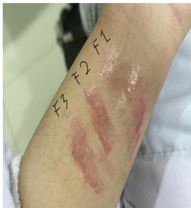
Figure 3. Irritation test