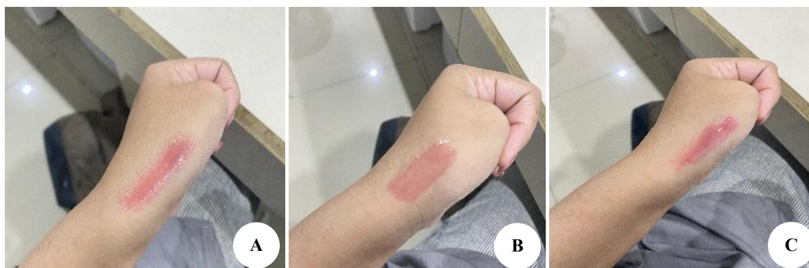
Figure 2. Stain test: A. F1, B. F2, C. F3