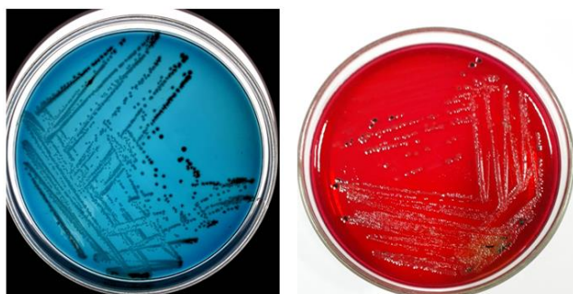
Figure 1. Salmonella profile on selective media HEA (blue) and XLD (red)

The choice of HEA and XLD selective media is because these two selective media are specific media for the isolation of Salmonella pathogenic bacteria. Andrews et al. (2007) explained that the profile of Salmonella on HEA and XLD media has a similar shape, which is the presence of black spots or not in the middle of the colony. A different matter was stated by Murray et al. (1999), which states that the HEA and XLD media are often used together to detect Salmonella because both of these media can also isolate Shigella . Both HEA and XLD have H 2 S indicators that can detect Salmonella from lactose-positive indicators.