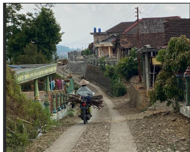
Figure 2. Transportation of firewood