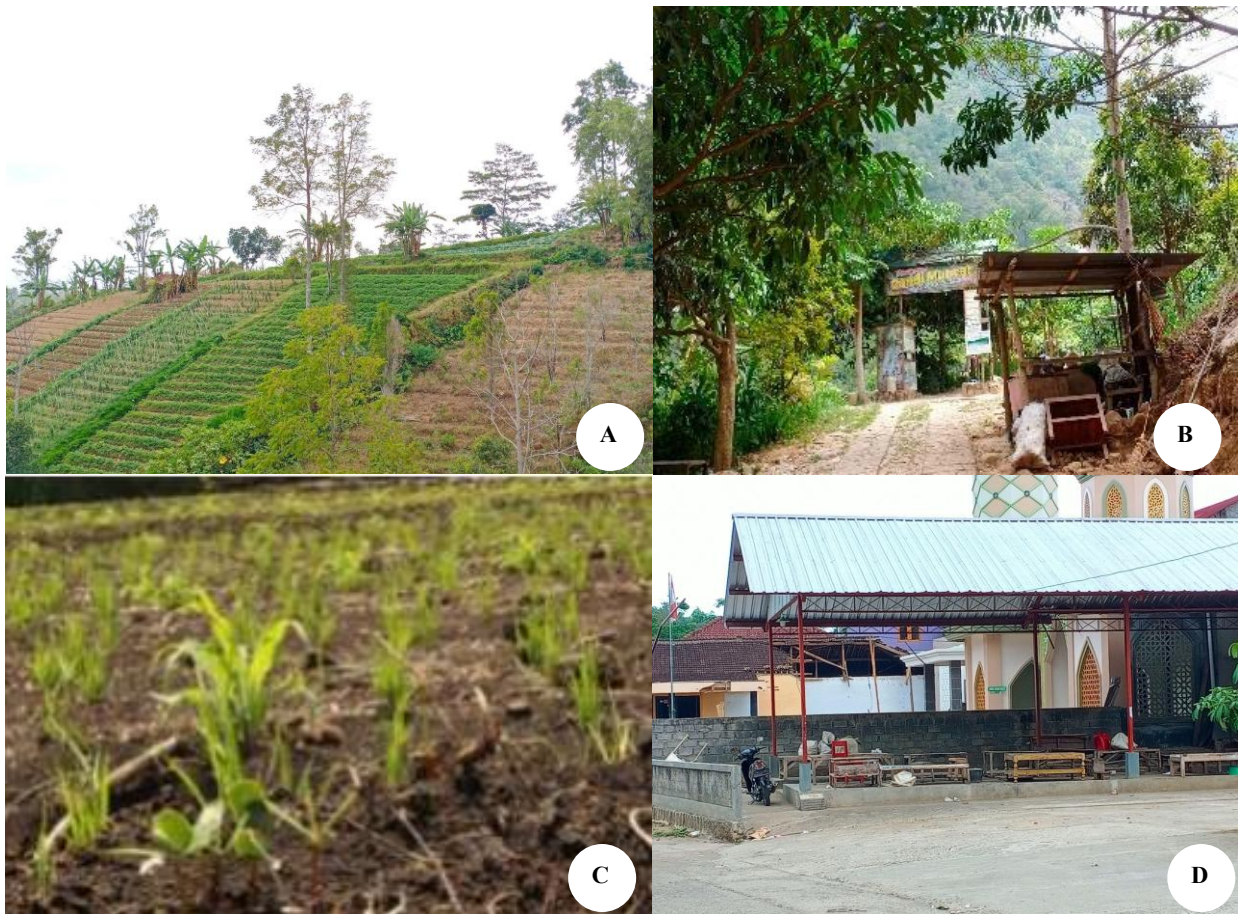
Figure 3. A. Agricultural land use, B. Muncar Temple in Wonogiri District, C. Intercropping system, D. Traditional selling place of crops

Muncar Temple as a tourist attraction, which showcasing efforts to diversify land use (Figure 3.B). Many challenges in managing agricultural land are pests, landslide risks, organic and inorganic fertilizers scarcity, and seasonal changes. However, the community still maintains traditional farming practices using hereditary teachings called ilmu titen , which involves planting with a certain consideration derived from ancestors and intercropping systems (Figure 3.C; planting several types of plants on the same land and time to use nutrients more effectively and reduce the risk of crop failure) (Utami et al. 2023). Land management is also adjusted to the season and land altitude, such as vegetable cultivation as the main crop because it does not depend on a particular season; planting cassava, corn, bananas, rice, and yams as intercrops because it adjusts to the existing season. Tobacco and coffee cultivation also require planting them in the highlands in the middle of the dry and rainy seasons. The farming method of the Wonogiri community can be categorized as mixed farming, reflecting a strong cultural heritage. The conventional agriculture application is considered the correct alternative and solves the world population's food and nutritional shortages and food security (Indahyani and Maga 2023).