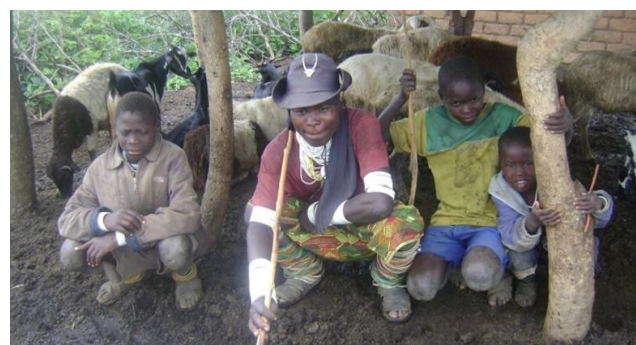
Figure 2. Children <15 years of Sukuma Tribe responsible for sheep herding

Note: *Data on percentages were based on multiple responses, and N = Total number of respondents interviewed