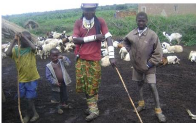
Figure 5. An open kraal for sheep