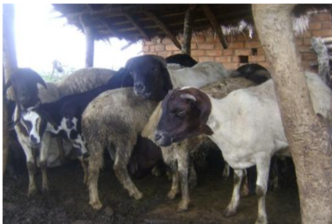
Figure 4. Stall/shed for sheep housing

The majority (80%) of smallholder farmers did not routinely control ectoparasites, and only a few (42%) adhered to routines (Table 18). Spraying (56.2%) was the standard method, while about 16.9% used to dip.