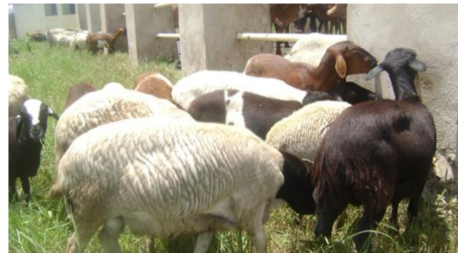
Figure 3. Variant cross group of local sheep strains kept by smallholder farmers in Nkasi District, Tanzania

Note: Data on percentages were based on multiple responses, and N = Total number of respondents interviewed